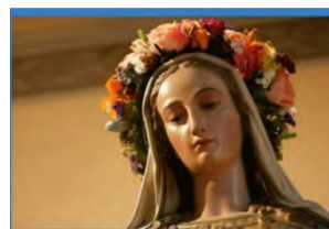
CROWNING OF MARY

The Crowning of Mary prayer service will be held on Friday, May 24 at 6:30 followed with refreshments in the church hall. The May crowning is a special devotion expressing love and gratitude to Mary, the Mother of Jesus. For many decades, the lovely words and melody of the hymn "Bring Flowers of the Rarest" have been gracing the beautiful traditional crowning of the Blessed Virgin Mary. The crowning is symbolic of Mary as Queen of Heaven and of our lives. Let us join in prayer and fellowship.